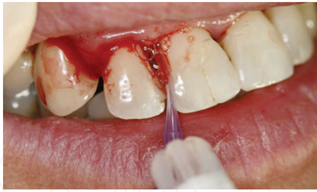
Figure 2. Ozone application into periodontal pocket [26].

in patients suffering from aggressive periodontitis. Statistically significant decreases in terms of pocket depth, plaque index, gingival index, and bacterial count were observed. In a study, authors compared the effect of oral irrigation with ozone water, 0.2% chlorhexidine and 10% povidone iodine, in chronic periodontitis patients and concluded that local ozone application could be used as a powerful atraumatic and antimicrobial agent in the nonsurgical treatment of periodontal disease for both home care and professional practice [30].