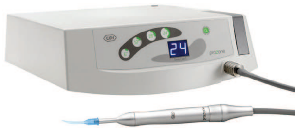
Figure 1. An ozone-generating system used in dental practice [17].