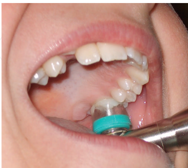
Figure 4. Ozone can be used easily on children [67].

In addition, ozone is an oxidative agent and can provide remineralization of demineralized dentin [21, 65]. The strongest acid naturally produced by acidogenic bacteria during caries formation is pyruvic acid. Pyruvic acid reacts with ozone and decarboxylates oxidatively to acetate and carbon dioxide. The remineralization of the initial caries lesions is supported by the buffered plaque fluid formed by the production of acetate [68]. Theoretically, ozone can be