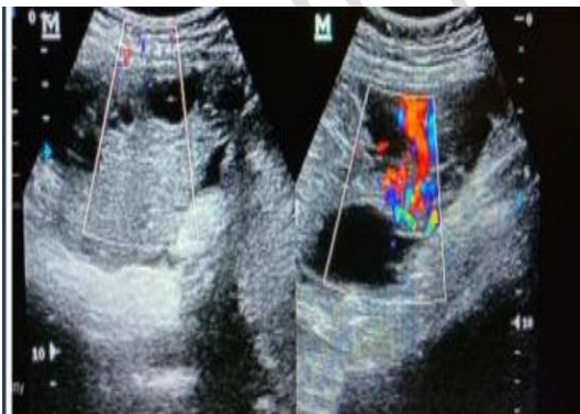
Fig 1- Colour velocimetry showing absent blood flow in right ovary

A 28 year-old Primigravida at 18 weeks of gestation, spontaneously conceived, came with acute abdomen associated with vomitting. Patient vitals were stable. On transabdominal ultrasonogram, bilateral multicystic ovaries with spoke wheel pattern was seen with Right ovary enlarged to 12 x 7 cm with features of torsion. Colour Doppler velocimetry showed sluggish blood flow .Left ovary enlarged to 9.9 x 9cm, both containing more than 10 thin walled locules with clear fluid and no soild components. Serum \beta hCG was 79,345 mIU/ml. Other blood analysis were normal. Fetus was appropriate to gestational age with no gross anomalies.